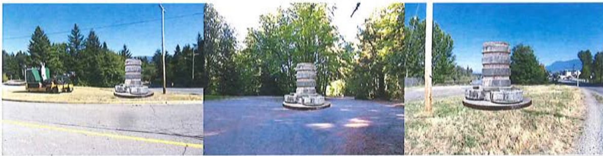
Industrial Heritage Centre