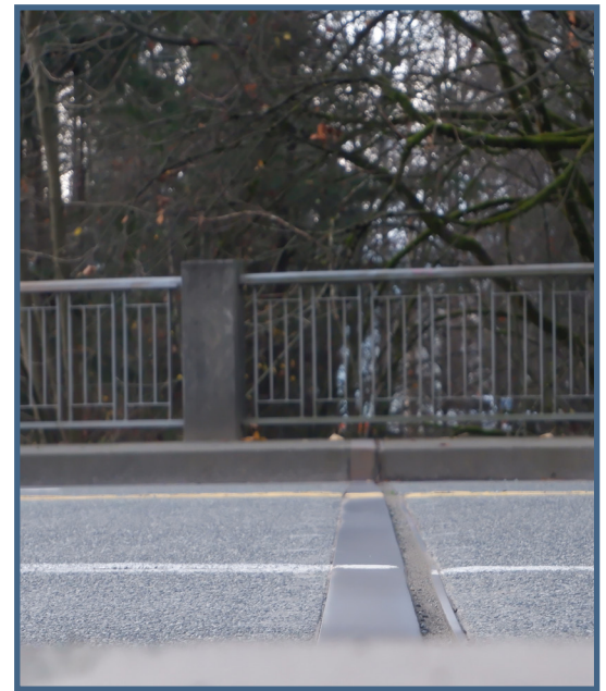
The bridge joint being replaced

Following completion, the new joint will be tested and once approved, the area will be restored to similar or better conditions and traffic patterns reinstated.