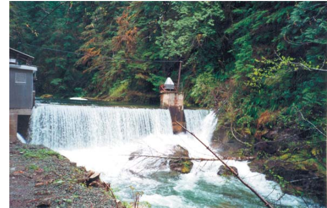
China Creek Intake