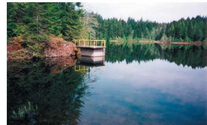
Bainbridge Lake Intake