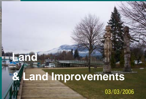
Land & Land Improvements